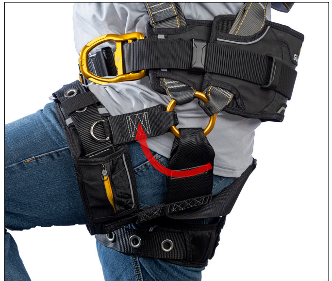
Full range of unrestricted movement