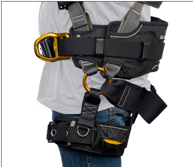
Unique O-Ring chassis design